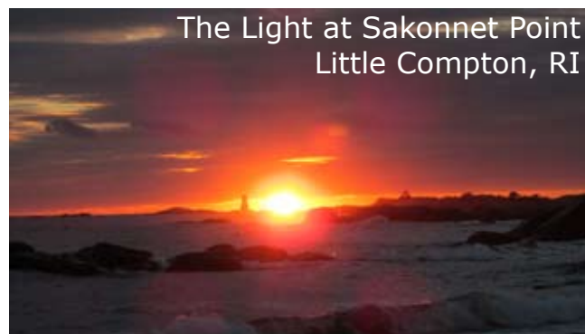
The Light at Sakonnet Point Little Compton, RI